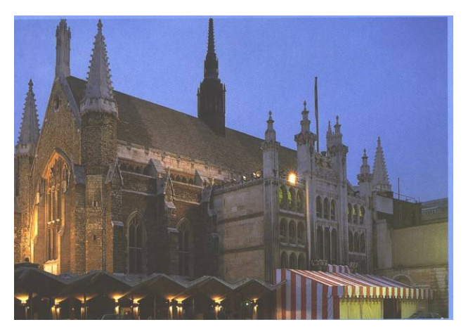
Guildhall, City of London