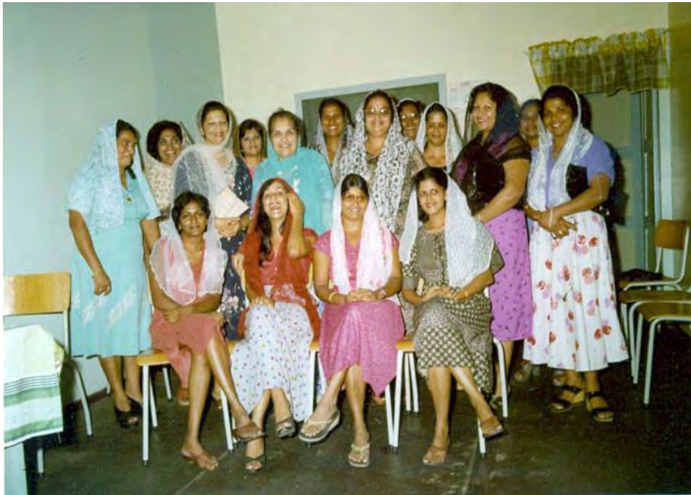
All smiles for the camera