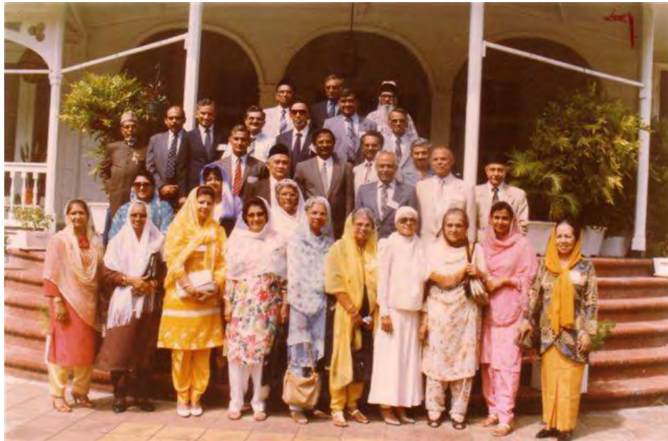
1989 Delegation visiting the President of Suriname H.E. R. Shankar