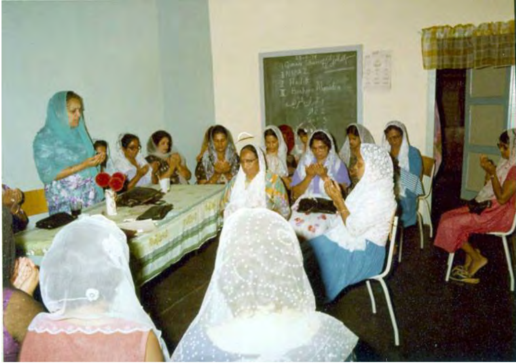
Ladies programme - 1979