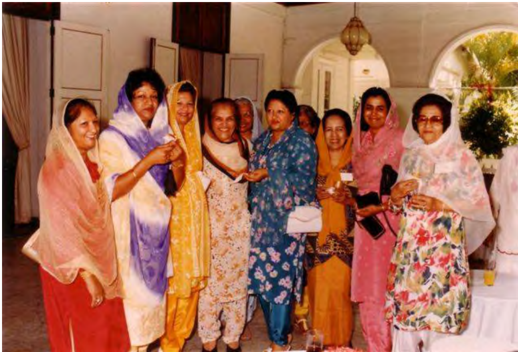
At the Presidential Palace – 1989