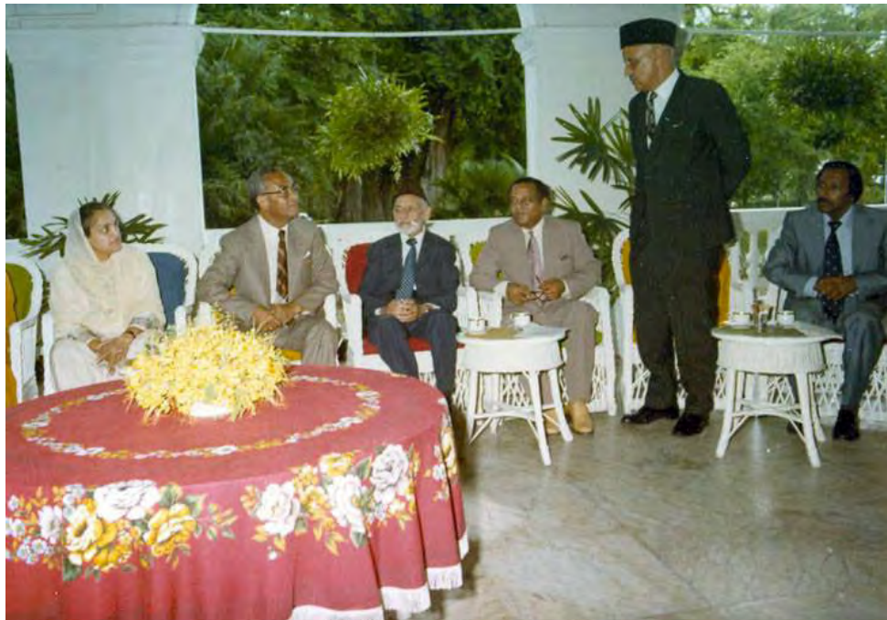
With other delegates at Presidential Palace meeting