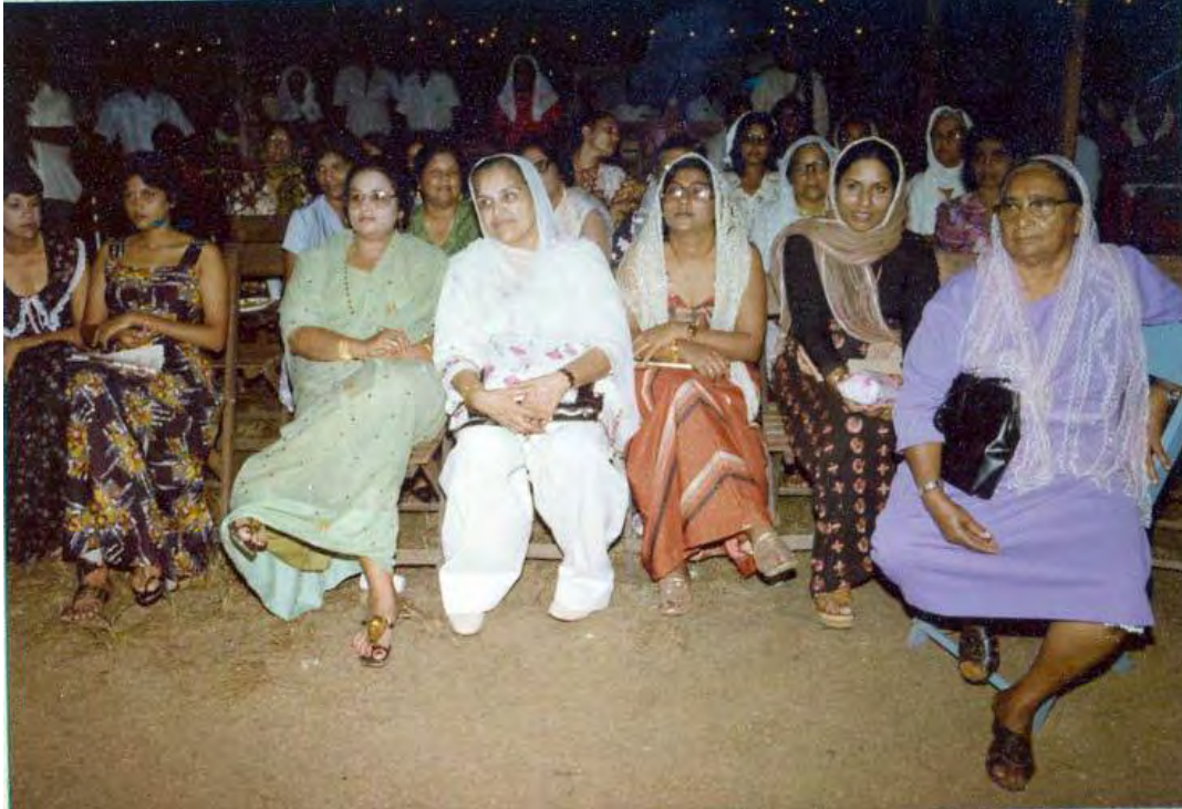
With other participants at the 1979 Convention