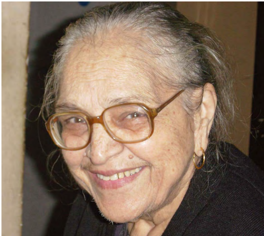
“A smile happens in a flash, but its memory can last a lifetime.” (05/Nov/05; At her home: Lahore, Pakistan)