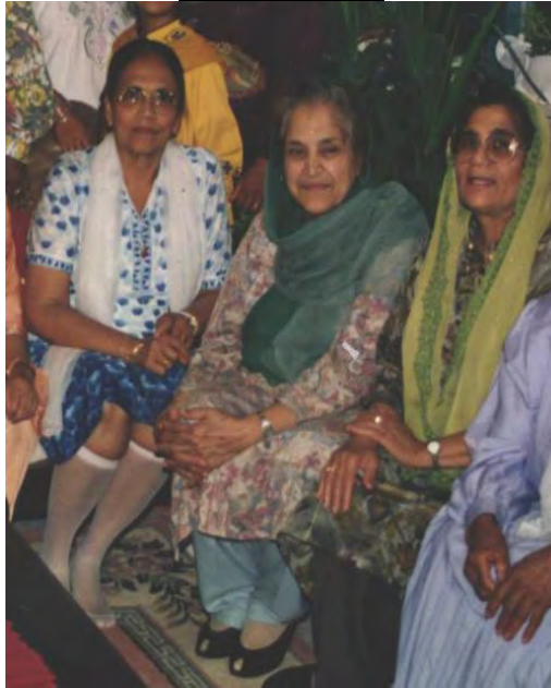
With some ladies of the Jama'at