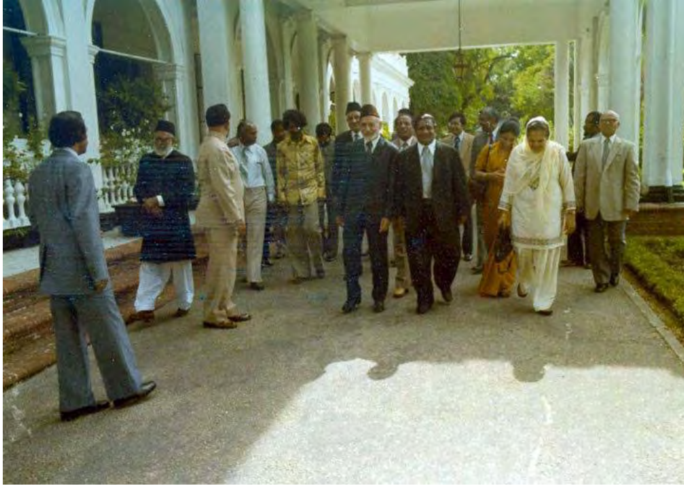
Leaving the Presidential Palace