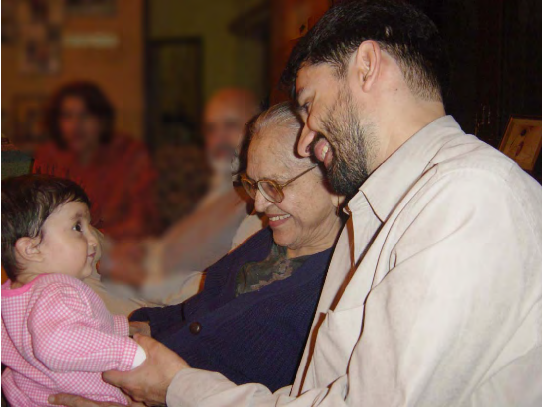
Not many live to see their great-grandchildren (05/Nov/05; At her home: Lahore, Pakistan)