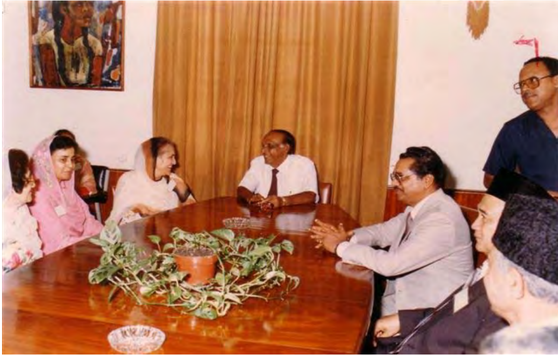
1989 Courtesy visit to the Speaker of the House Mr. J. Lachmon