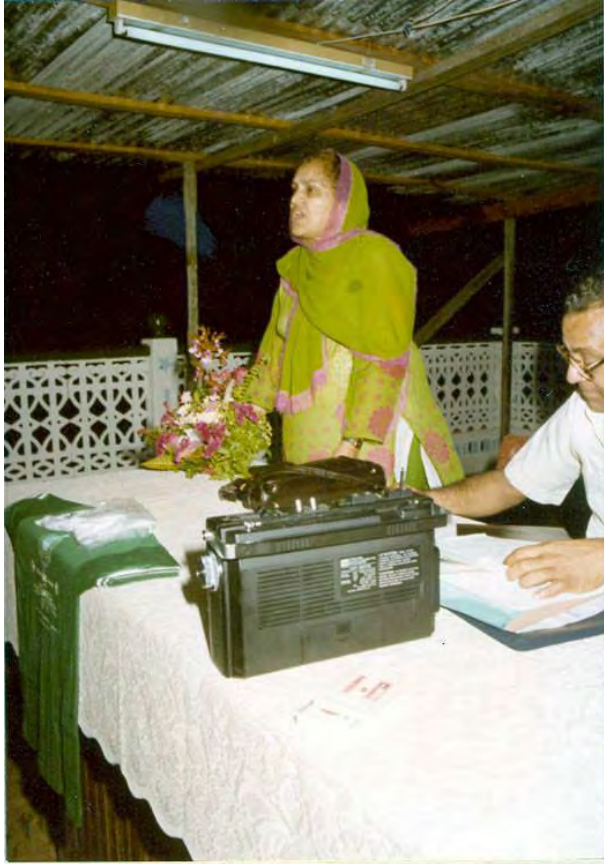
Speaking at SIV Convention in 1989