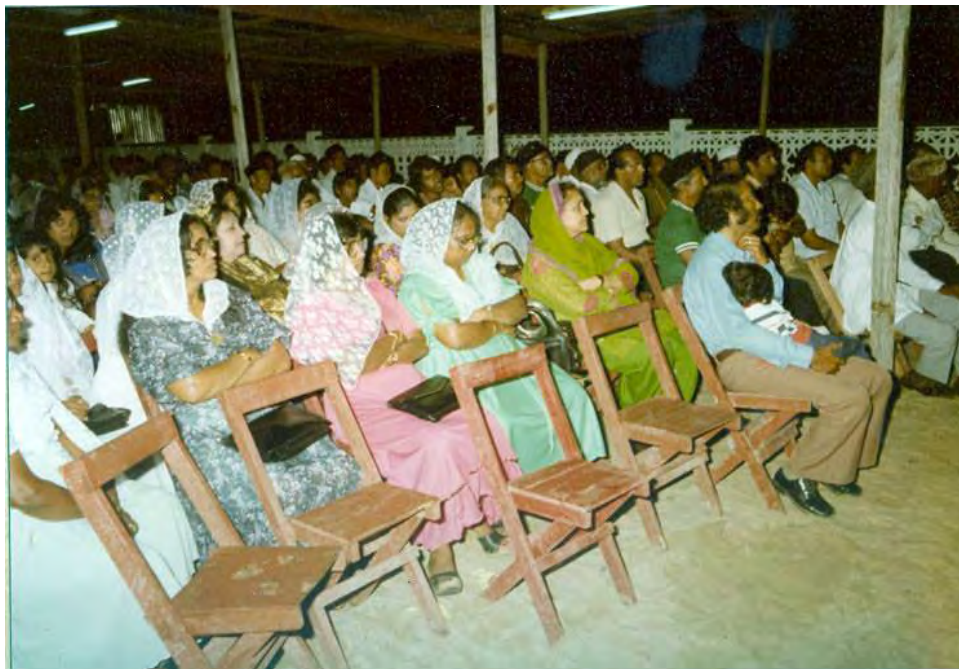
An attentive member of the audience