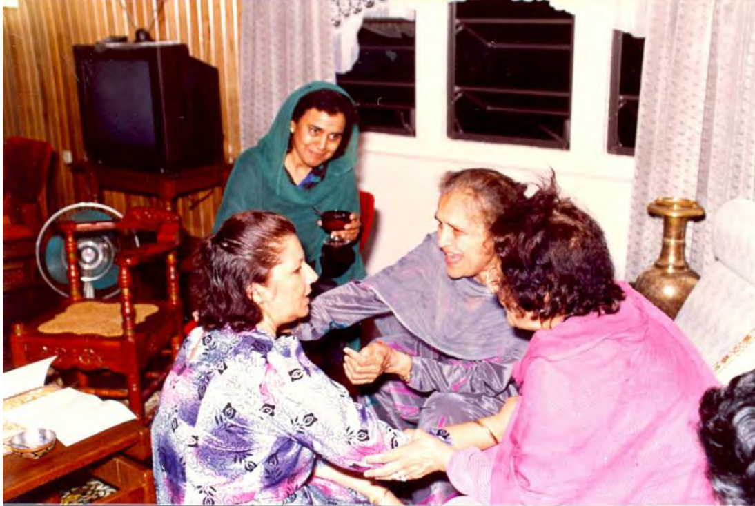
Enjoying a light moment with friends