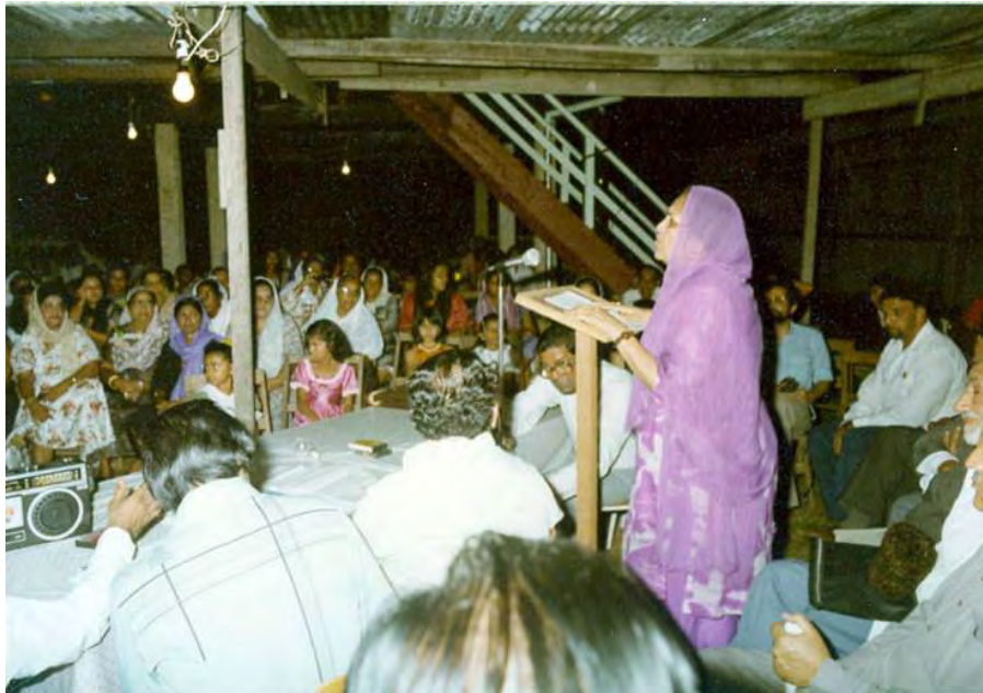
Addressing the audience at SIV Convention in 1979