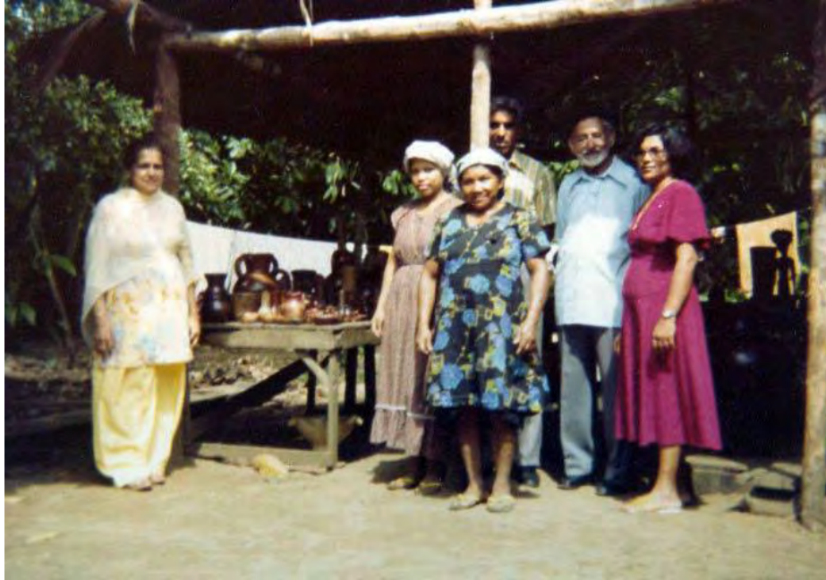
Visiting the interior of Suriname