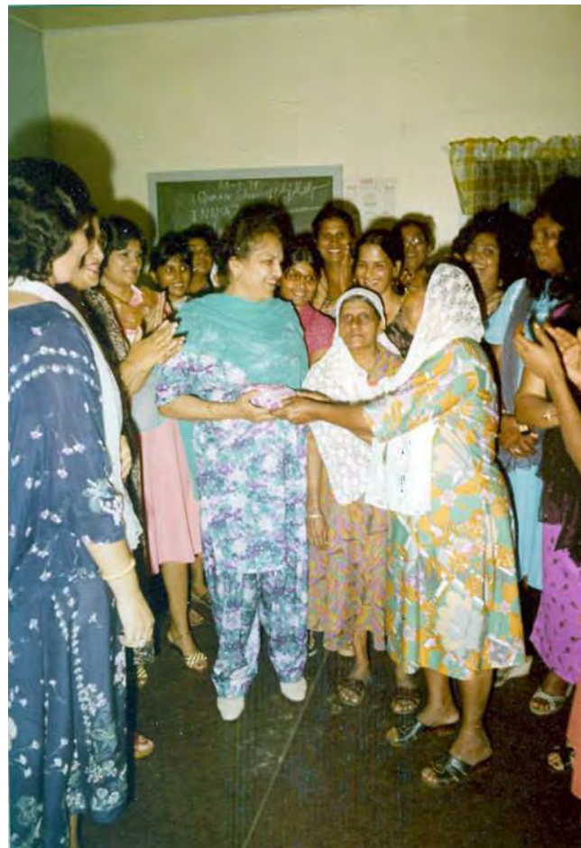
Surrounded by loving admirers