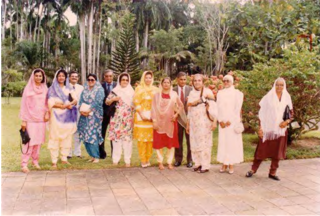
Presidential Palace Garden – 1989