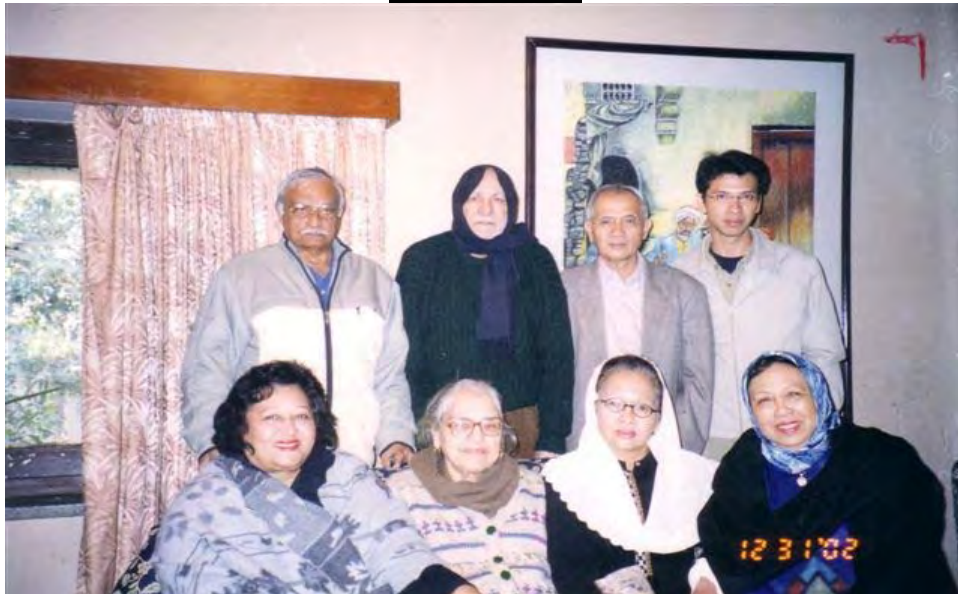
At home with guests from Indonesia and Suriname