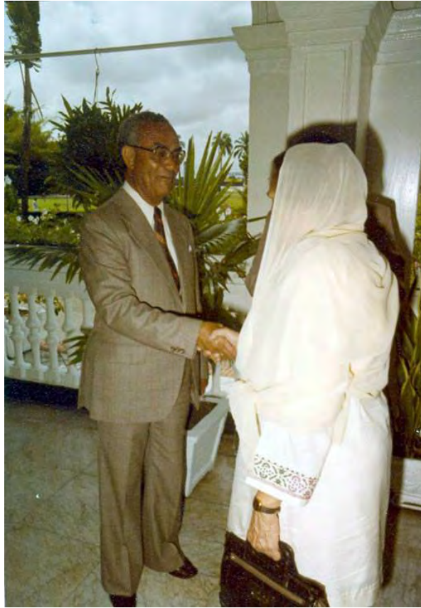
Meeting Dr Johan Ferrier, President of Suriname