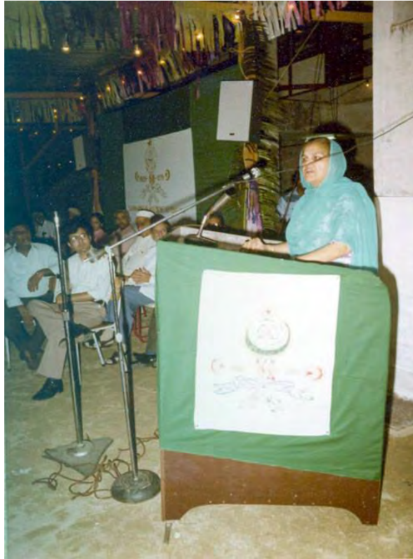
Speaking at SIV Convention in 1979