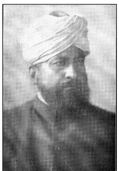
Khwaja Kamal-ud-Din (1870–1932)