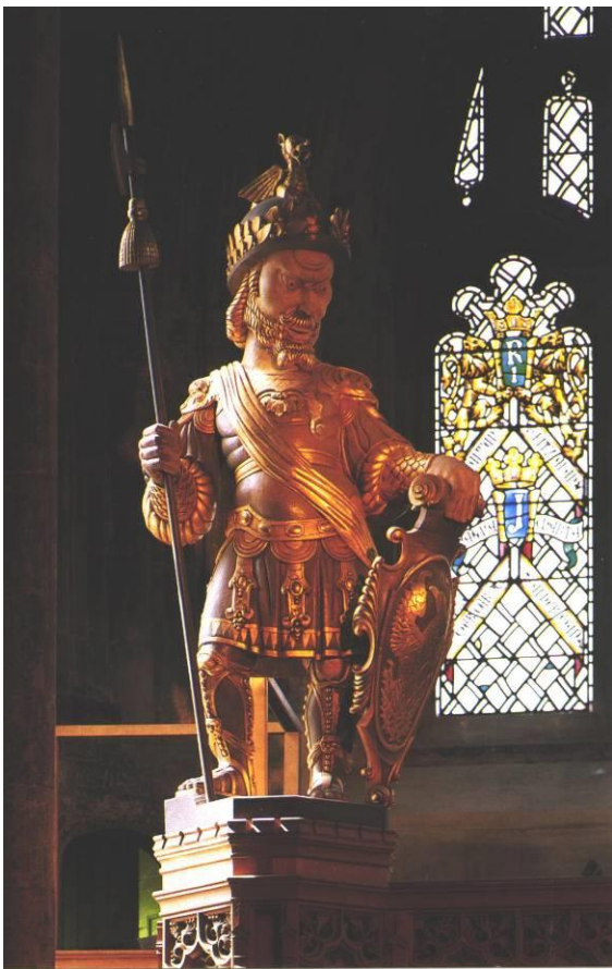
Statue of Magog in Guildhall

In the Hadith, that is, the reported sayings of the Holy Prophet, Gog and Magog have been mentioned as another name for Dajjal or Anti-Christ and are associated with the appearance of the Promised Messiah. The term “Dajjal” describes the religious and cultural aspects of the people concerned, while Gog and Magog describe their racial identity. But detailed as are the descriptions of Dajjal (Anti-Christ) and Gog and Magog in the Hadith, it never occurred to any Muslim scholar before our times that these people would be some well-known and highly cultured nations of the world with whom the Muslims were to deal and it was left for Mirza Ghulam Ahmad, the Promised Messiah, to recognise these people and proclaim in clear terms without any doubt or hesitation: