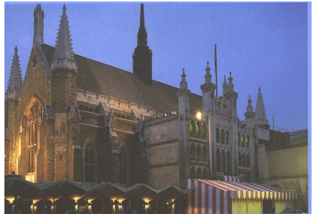
Guildhall, City of London