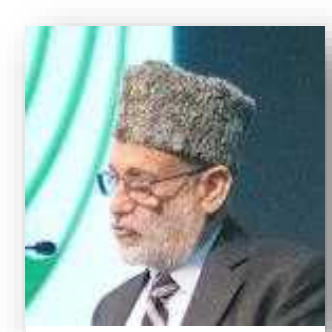
Hazrat Ameer addressing the conference.

Holy Quran as most of them did not know Arabic, the language it was revealed in. The translation of the Holy Quran was considered heresy by the religious teachers and