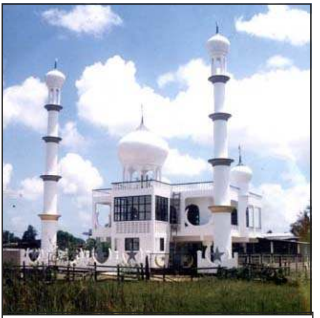
Hagigat-ul-Islam Mosque of the Ahmadiyya Anjuman Isha'at Islam Lahore in Suriname