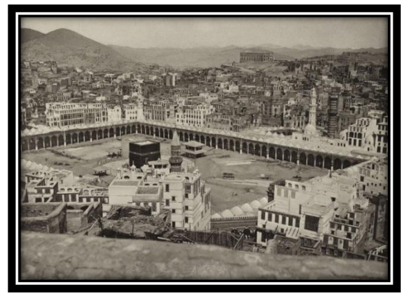
Ishmael, to my mind, are the heroes in this festival of Eid al-Adha.