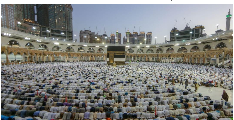
3) Warfare is not for compelling people to embrace Islam, as that would defeat the principal ruling of the Qur'an in many verses.

The claim that the Quran commands Muslims to murder non-believers is simply false.